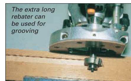
The extra long rebater can be used for grooving