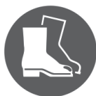
Wear protective footwear