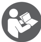
Refer to instruction manual

IMPORTANT: PLEASE READ THESE INSTRUCTIONS CAREFULLY. NOTE THE SAFE OPERATIONAL REQUIREMENTS, WARNINGS & CAUTIONS. USE THE PRODUCT CORRECTLY AND WITH CARE FOR THE PURPOSE FOR WHICH IT IS INTENDED. FAILURE TO DO SO MAY CAUSE DAMAGE AND/OR PERSONAL INJURY AND WILL INVALIDATE THE WARRANTY. KEEP THESE INSTRUCTIONS SAFE FOR FUTURE USE.