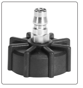
Straight Adaptor - Model No. VS820SA.