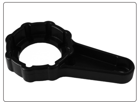
Pump Cap Wrench.

Parts support is available for this product. Please email sales@sealey.co.uk or telephone 01284 757500