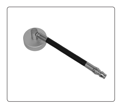
Ø45mm Brake Pressure Bleeder Cap -90° Connector With Hose. Model No. Model No. VS0204C4

Parts support is available for this product. Please email sales@sealey.co.uk or telephone 01284 757500