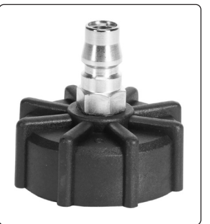
Straight Adaptor - Model No. VS820SA.