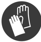
Wear Protective Gloves