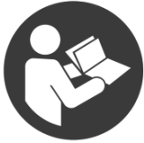
Refer to Instruction Manual

IMPORTANT: PLEASE READ THESE INSTRUCTIONS CAREFULLY. NOTE THE SAFE OPERATIONAL REQUIREMENTS, WARNINGS & CAUTIONS. USE THE PRODUCT CORRECTLY AND WITH CARE FOR THE PURPOSE FOR WHICH IT IS INTENDED. FAILURE TO DO SO MAY CAUSE DAMAGE AND/OR PERSONAL INJURY AND WILL INVALIDATE THE WARRANTY. KEEP THESE INSTRUCTIONS SAFE FOR FUTURE USE.