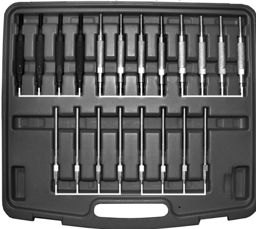
Adaptor Studs (5 sets)

Parts support is available for this product. To obtain a parts listing and/or diagram, please log on to www.sealey.co.uk , email sales@sealey.co.uk or phone 01284 757500.