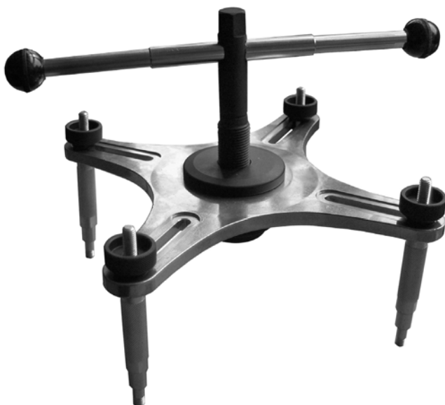
Assembled alignment tool

Assembly Flywheel Threads: \varnothing 6 \times 1.00\text{mm} , \varnothing 7 \times 1.00\text{mm} , \varnothing 8 \times 1.25\text{mm}