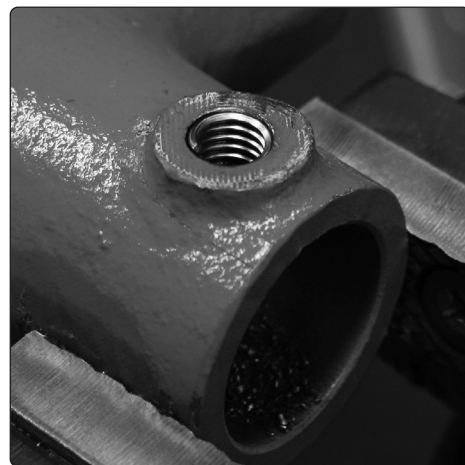
4.6 Thread is repaired and ready to use.