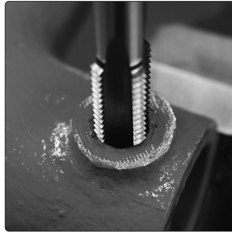
4.2 Tap drilled hole using screw tap provided.