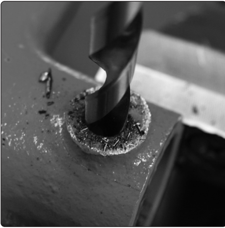
4.1 Drill out the damaged thread using the correctly sized twist drill bit provided.