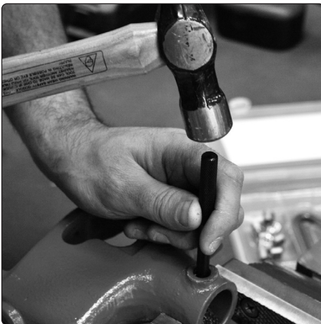
4.5 Remove the tag from the insert using the breaking pin tool.