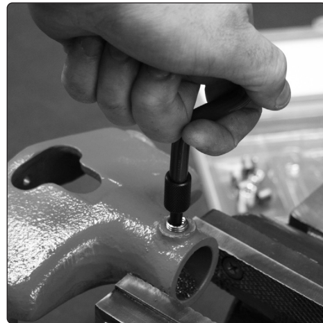
4.4 Screw insert into threaded hole.