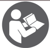
Refer to Instruction Manual

IMPORTANT: PLEASE READ THESE INSTRUCTIONS CAREFULLY. NOTE THE SAFE OPERATIONAL REQUIREMENTS, WARNINGS & CAUTIONS. USE THE PRODUCT CORRECTLY AND WITH CARE FOR THE PURPOSE FOR WHICH IT IS INTENDED. FAILURE TO DO SO MAY CAUSE DAMAGE AND/OR PERSONAL INJURY AND WILL INVALIDATE THE WARRANTY. KEEP THESE INSTRUCTIONS SAFE FOR FUTURE USE.