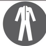
Wear Protective Clothing