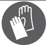
Wear Protective Gloves