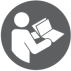
Refer to Instructions