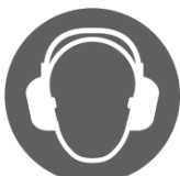
Wear ear protection