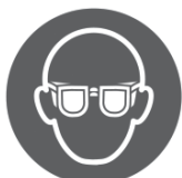
Wear eye protection