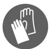
Wear protective clothing