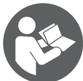
Refer to instruction manual

IMPORTANT: PLEASE READ THESE INSTRUCTIONS CAREFULLY. NOTE THE SAFE OPERATIONAL REQUIREMENTS, WARNINGS & CAUTIONS. USE THE PRODUCT CORRECTLY AND WITH CARE FOR THE PURPOSE FOR WHICH IT IS INTENDED. FAILURE TO DO SO MAY CAUSE DAMAGE AND/OR PERSONAL INJURY AND WILL INVALIDATE THE WARRANTY. KEEP THESE INSTRUCTIONS SAFE FOR FUTURE USE.