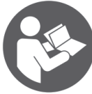
Refer to instruction manual

IMPORTANT: PLEASE READ THESE INSTRUCTIONS CAREFULLY. NOTE THE SAFE OPERATIONAL REQUIREMENTS, WARNINGS & CAUTIONS. USE THE PRODUCT CORRECTLY AND WITH CARE FOR THE PURPOSE FOR WHICH IT IS INTENDED. FAILURE TO DO SO MAY CAUSE DAMAGE AND/OR PERSONAL INJURY AND WILL INVALIDATE THE WARRANTY. KEEP THESE INSTRUCTIONS SAFE FOR FUTURE USE.