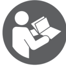
Refer to instruction manual

IMPORTANT: PLEASE READ THESE INSTRUCTIONS CAREFULLY. NOTE THE SAFE OPERATIONAL REQUIREMENTS, WARNINGS & CAUTIONS. USE THE PRODUCT CORRECTLY AND WITH CARE FOR THE PURPOSE FOR WHICH IT IS INTENDED. FAILURE TO DO SO MAY CAUSE DAMAGE AND/OR PERSONAL INJURY AND WILL INVALIDATE THE WARRANTY. KEEP THESE INSTRUCTIONS SAFE FOR FUTURE USE.