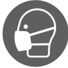
Wear face mask