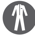
Wear protective clothing