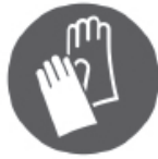
Wear protective gloves