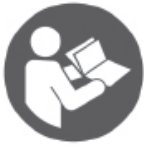
Refer to instructions

IMPORTANT: PLEASE READ THESE INSTRUCTIONS CAREFULLY. NOTE THE SAFE OPERATIONAL REQUIREMENTS, WARNINGS & CAUTIONS. USE THE PRODUCT CORRECTLY AND WITH CARE FOR THE PURPOSE FOR WHICH IT IS INTENDED. FAILURE TO DO SO MAY CAUSE DAMAGE AND/OR PERSONAL INJURY AND WILL INVALIDATE THE WARRANTY. KEEP THESE INSTRUCTIONS SAFE FOR FUTURE USE.