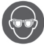
Wear eye protection