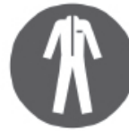
Wear protective clothing