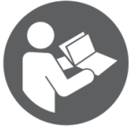
Refer to Instructions

IMPORTANT: PLEASE READ THESE INSTRUCTIONS CAREFULLY. NOTE THE SAFE OPERATIONAL REQUIREMENTS, WARNINGS & CAUTIONS. USE THE PRODUCT CORRECTLY AND WITH CARE FOR THE PURPOSE FOR WHICH IT IS INTENDED. FAILURE TO DO SO MAY CAUSE DAMAGE AND/OR PERSONAL INJURY AND WILL INVALIDATE THE WARRANTY. KEEP THESE INSTRUCTIONS SAFE FOR FUTURE USE.