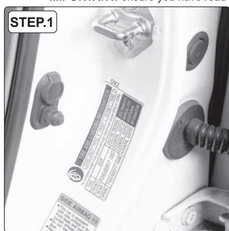
Check the door jamb or fuel door for correct tyre pressure. Alternatively check the vehicle's manual

IMPORTANT: ensure you have read and understand all safety instructions before operating the device.