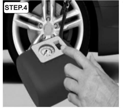
Press the power button to start inflating. The mini compressor will commence operation. Press the power button to stop the unit once desired pressure is reached.

NOTE: If unit does not come on check the fuse in the 12V plug. Replace if blown.