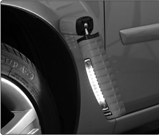
360° Swivel and tilt function. Base magnet