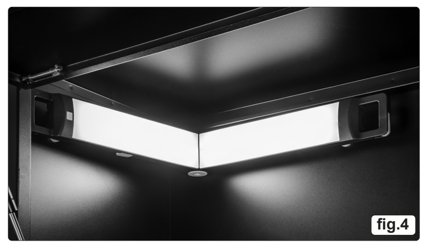
Corner light for inside tool box or overhead cupboard