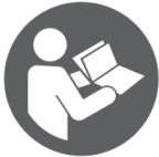
Refer to Instructions

IMPORTANT: PLEASE READ THESE INSTRUCTIONS CAREFULLY. NOTE THE SAFE OPERATIONAL REQUIREMENTS, WARNINGS & CAUTIONS. USE THE PRODUCT CORRECTLY AND WITH CARE FOR THE PURPOSE FOR WHICH IT IS INTENDED. FAILURE TO DO SO MAY CAUSE DAMAGE AND/OR PERSONAL INJURY AND WILL INVALIDATE THE WARRANTY. KEEP THESE INSTRUCTIONS SAFE FOR FUTURE USE.