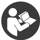
Refer to Instruction Manual

IMPORTANT: PLEASE READ THESE INSTRUCTIONS CAREFULLY. NOTE THE SAFE OPERATIONAL REQUIREMENTS, WARNINGS & CAUTIONS. USE THE PRODUCT CORRECTLY AND WITH CARE FOR THE PURPOSE FOR WHICH IT IS INTENDED. FAILURE TO DO SO MAY CAUSE DAMAGE AND/OR PERSONAL INJURY AND WILL INVALIDATE THE WARRANTY. KEEP THESE INSTRUCTIONS SAFE FOR FUTURE USE.