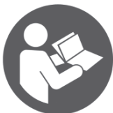
Refer to instruction manual

IMPORTANT: PLEASE READ THESE INSTRUCTIONS CAREFULLY. NOTE THE SAFE OPERATIONAL REQUIREMENTS, WARNINGS & CAUTIONS. USE THE PRODUCT CORRECTLY AND WITH CARE FOR THE PURPOSE FOR WHICH IT IS INTENDED. FAILURE TO DO SO MAY CAUSE DAMAGE AND/OR PERSONAL INJURY AND WILL INVALIDATE THE WARRANTY. KEEP THESE INSTRUCTIONS SAFE FOR FUTURE USE.