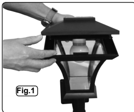
Lamp canopy removal (no tools required)