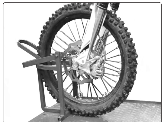
OPEN (LOADING POSITION).