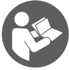
Refer to instructions

IMPORTANT: PLEASE READ THESE INSTRUCTIONS CAREFULLY. NOTE THE SAFE OPERATIONAL REQUIREMENTS, WARNINGS & CAUTIONS. USE THE PRODUCT CORRECTLY AND WITH CARE FOR THE PURPOSE FOR WHICH IT IS INTENDED. FAILURE TO DO SO MAY CAUSE DAMAGE AND/OR PERSONAL INJURY AND WILL INVALIDATE THE WARRANTY. KEEP THESE INSTRUCTIONS SAFE FOR FUTURE USE.