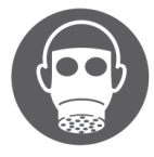
Wear respiratory mask (fumes)