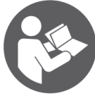
Refer to instruction manual

IMPORTANT: PLEASE READ THESE INSTRUCTIONS CAREFULLY. NOTE THE SAFE OPERATIONAL REQUIREMENTS, WARNINGS & CAUTIONS. USE THE PRODUCT CORRECTLY AND WITH CARE FOR THE PURPOSE FOR WHICH IT IS INTENDED. FAILURE TO DO SO MAY CAUSE DAMAGE AND/OR PERSONAL INJURY AND WILL INVALIDATE THE WARRANTY. KEEP THESE INSTRUCTIONS SAFE FOR FUTURE USE.