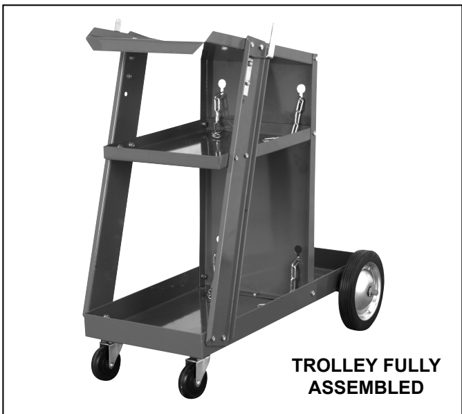
TROLLEY FULLY ASSEMBLED