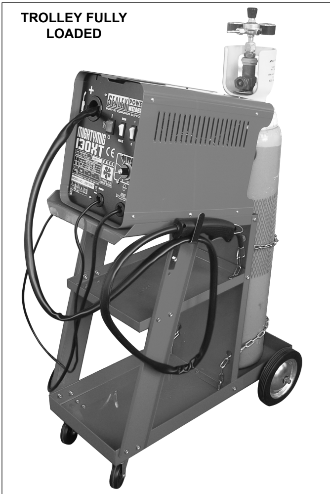
TROLLEY FULLY LOADED