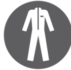
Wear protective clothing