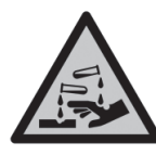
Warning: corrosive substance