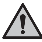
Warning: explosive material