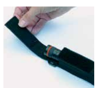
The torch is supplied in a tough fabric storage pouch, featuring a ring for securing on a belt