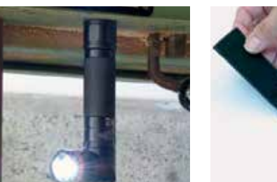
... great for working on machinery with cast-iron beds when sharpening or adjusting cutters