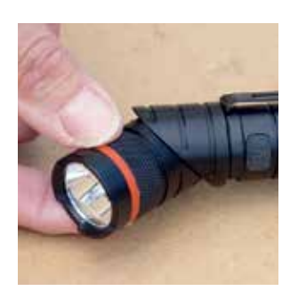
You can swivel the head of the torch to any position between 0 and 90 ^\circ