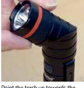
Point the torch up towards the ceiling for that essential lighting maintenance or emergency work