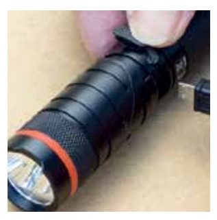
The Micro USB plug is a tight fit into the port on the torch, revealed by lifting a rubberised flexible flap

again a soft-grip rubber affair. This glows nicely when activated and switches to red when battery capacity drops below about 3.3V, when it starts to flash. You'll find there's still plenty of power left, though. Red is also displayed during charging.