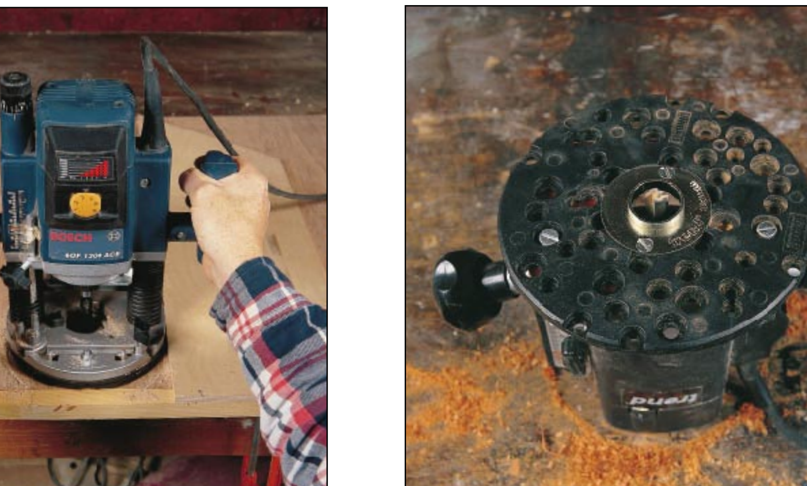
◀ A Trend guidebush and cutter installed after centring the Unibase

Being able to extend its use, both as a sub-base for awkward freehand work and its inherent concentricity once set up properly, extends its value well beyond the catalogue price of £14.70 inc VAT. ●