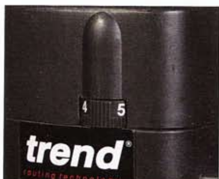
The speed control is mounted on the body