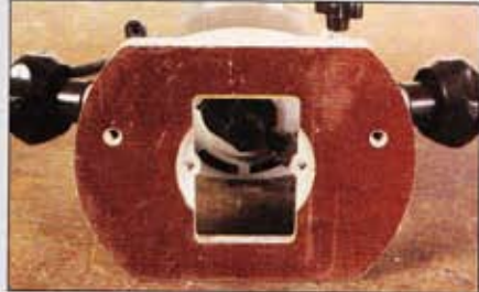
The Trend baseplate is ruggedly simple