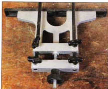
The side fence has a built-in fine adjuster