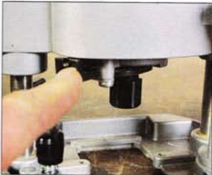
The spindle lock is easy to use