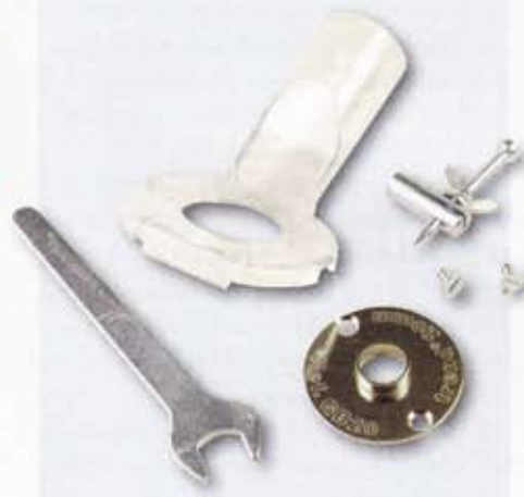
The T5 is accompanied with guide bush, wrench and extractor port

selection for different size cutters or types of material.