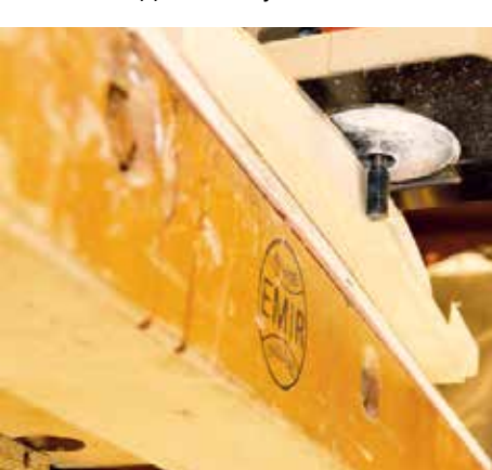
Using the guide bush, you can easily work with templates and jigs

The fence remains a fine adjustable cast alloy version as standard with sliding cheeks to allow the fence aperture to be reduced for different applications, just as it was in