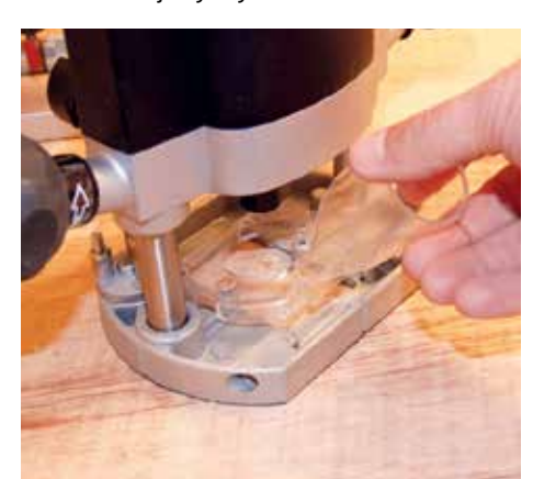
A clip-in dust kit is supplied to control the dust and help keep the work area clear as you rout

The plunge is another area of great ergonomic forethought and where the T5 bucks the trend for most router designs. While the majority rely on a lever lock for the