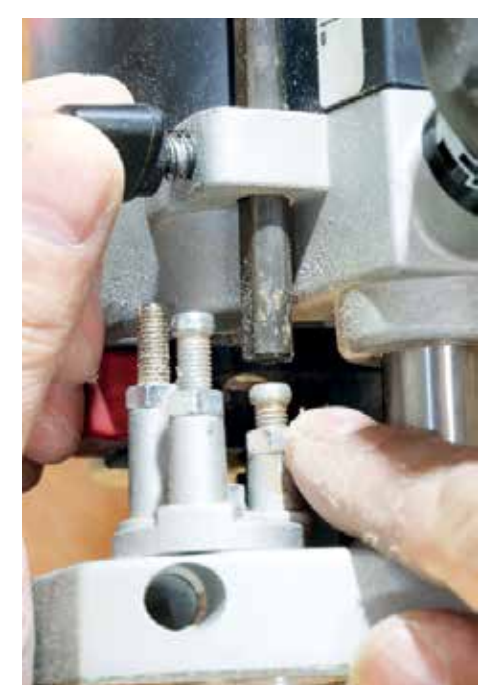
The rotating turret and depth post are simple but very effective for many routing jobs

The height adjustment out of the box remains the same as the original Elu; a simple depth post dropping down to a rotating three-post turret. Simplistic as it is, the design is clever and