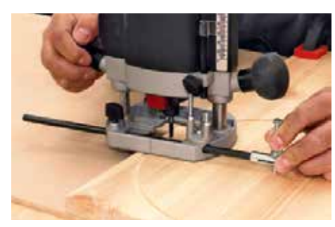
Also supplied in the kit is the trammel point for circle and arc work