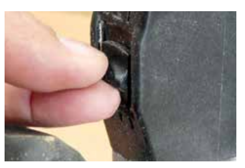
The side-mounted sliding power switch is easy to operate