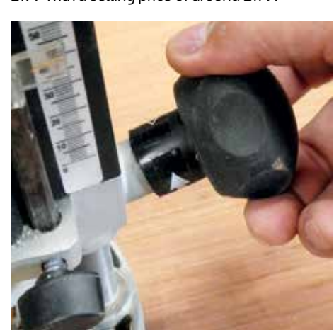
The simple twist lock plunge is great for fast, easy and controllable plunges

So nearly two decades on, the Trend T5 retains its place in the industry and continues to be a firm favourite here at GW as well as out in the field, but most remarkable of all has to be its price. Back in 1998 the RRP for the T5 was £199 with a selling price of around £179.