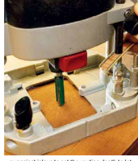
... or against inlays to set the routing depth to let them in perfectly flush

This was certainly a decent price back then for a tool that could do so much and with so many accessories available, but now, in 2017, the T5, thanks to a UK wide promotional offer, can be picked up for a steal at just £149.