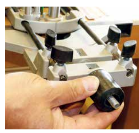
The fence is excellent and comes with a fine adjuster as standard

It's not just about the ergonomics, however; Trend made a big impact on the market with the range of router accessories they introduced with many new, radical and innovative designs in their day, thinking well outside the box and intending the user to get the full use from a router, and this innovation continues to this day. The base design of the Elu routers that were