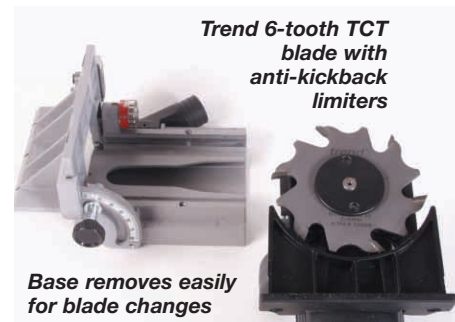
Base removes easily for blade changes