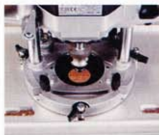
Router secured with QD clamps

supplied with all the standard accessories that you will ever need. The whole unit is large enough to provide good workpiece support, while still being light enough to transport easily. Overall this is a highly impressive table.