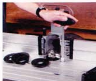
Adjusting the router height

The Trend is a particularly easy table to set up and use. The components are all well made and smartly finished. The fence adjusts smoothly and locks firmly in position. The guards and hold-downs are well designed, the overall quality is first rate and it is