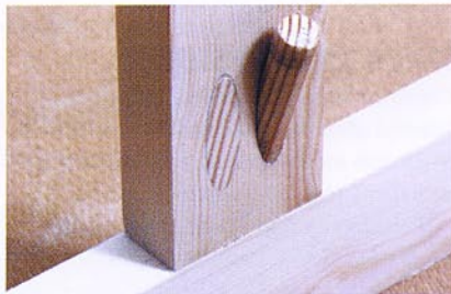
T-joint with plugs: one projecting, one sanded smooth