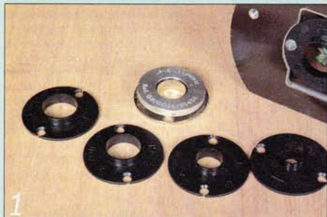
The bushes supplied with the jig are imperial sizes

It is at this point that you must ask yourself if there is an easier way. Maybe use a bench mortiser to cut the mortise and use the Trend jig to cut the tenons. This really illustrates what we are trying to show here. Use whatever method makes the most