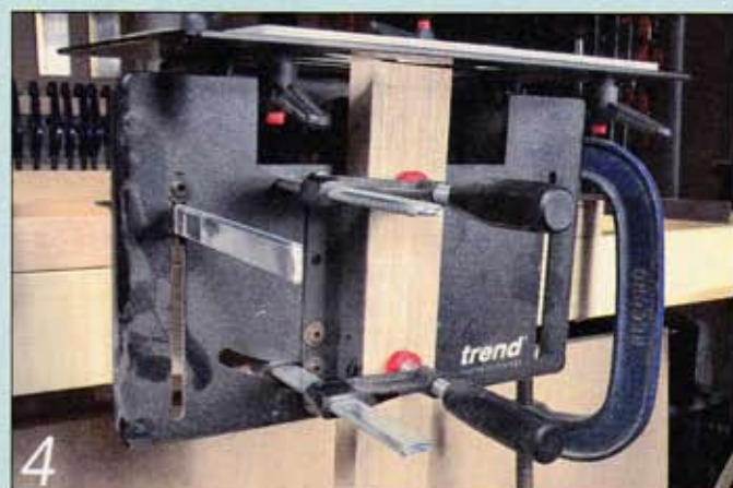
4 clamping the wood in the jig..