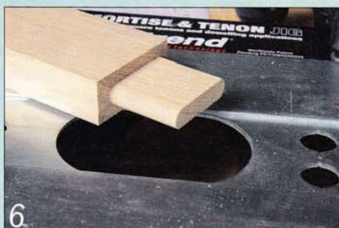
6 Several shallow passes will produce a nice clean tenon time after time