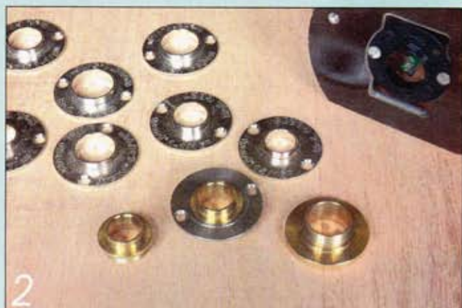
American and European guide bushes will fit most routers either directly or by using an adapter base