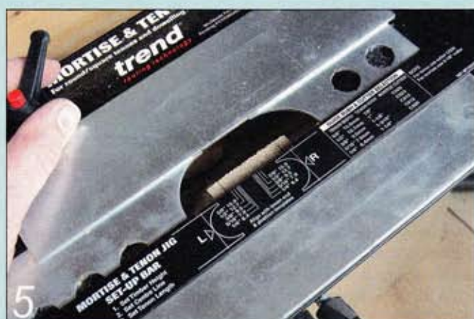
5 ...and adjusting the top plate