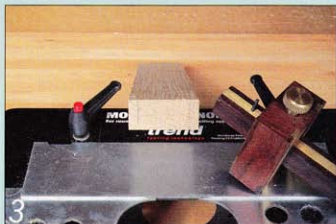
3 Marking the end of the timber to be tenoned