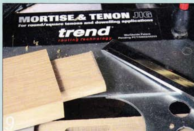
9 A very light chamfer on the edges of the tenon will ease the assembly