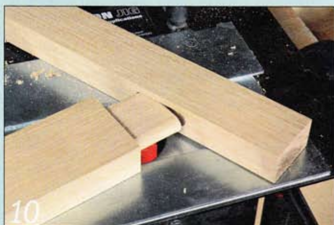
10 Assembling the joint