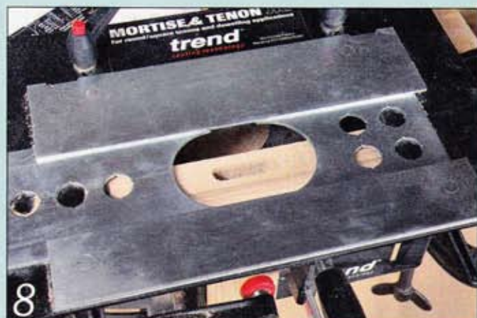
8 Several shallow cuts will soon have the mortise cut to depth