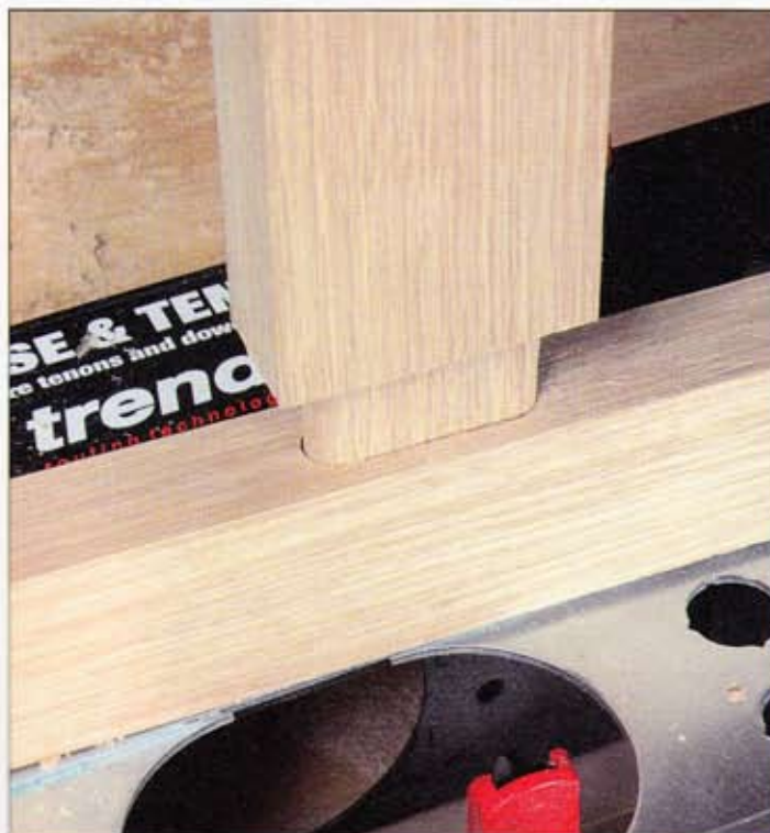
11 The perfect fit every time

sense. Just because you have just spent good money on a jig or a tool it does not mean that it will tackle every job in the workshop. The art of this is to use the correct tool (jig) for the job in hand.