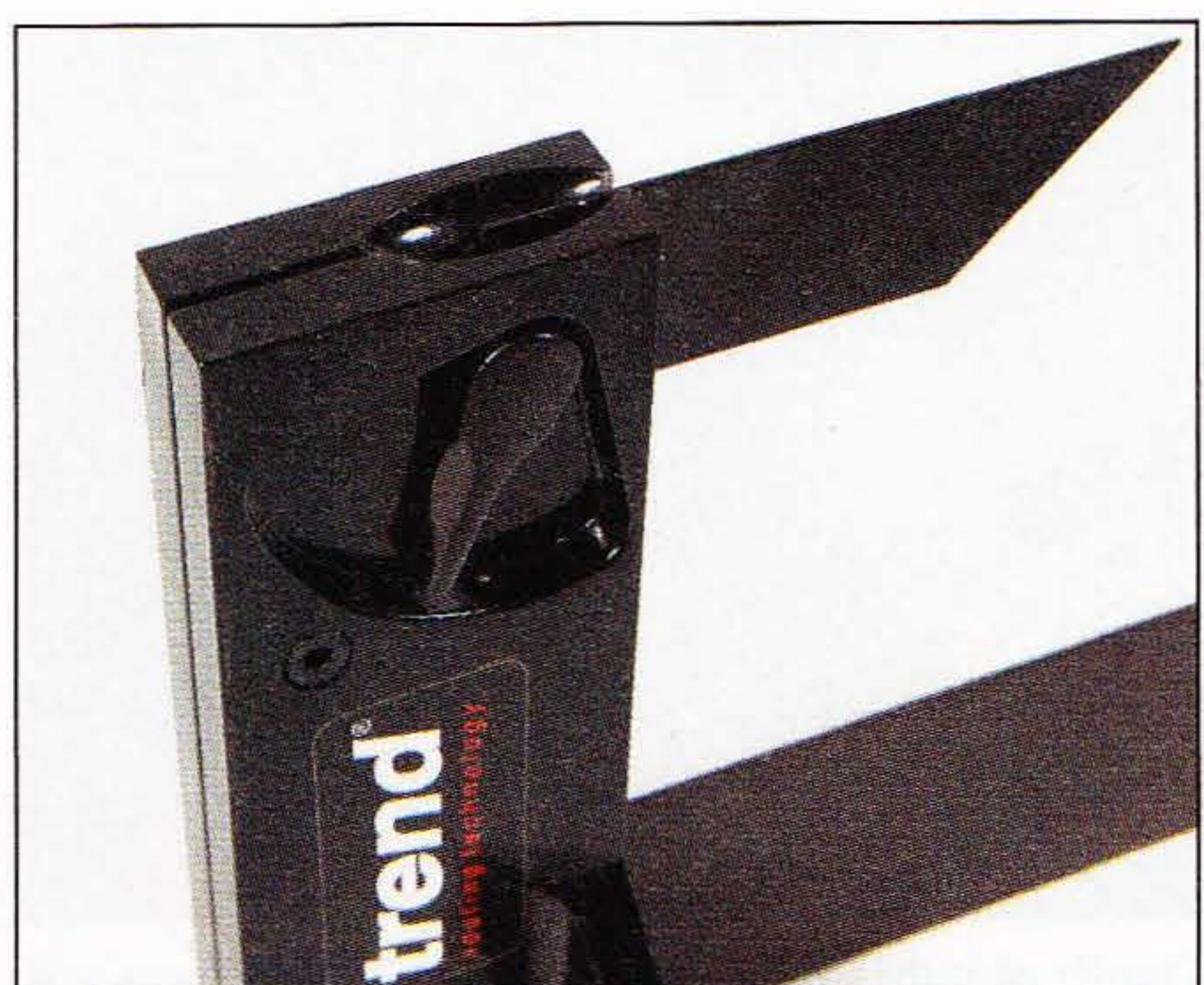
The inset bevel gauge and cam lever