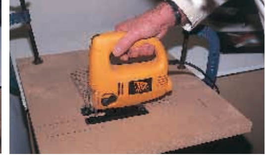
Even when using the circular saw, a jigsaw completes cutting Forming rebate using straight cutter in the corners