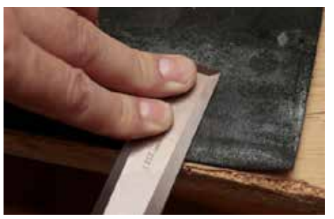
▲ It does work well enough but the leather is best bonded to a board