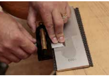
▲ Blade projection is sufficient to allow easy backing off while still in the guide

to the correct position as it is tightened. This method of gripping the blades may be slightly limiting for some as it means that only dovetail chisels, plane irons or blades with a thickness of less than 7mm will slide under the shoulders to secure them, but that should cover most general day-to-day tools. The overall width capacity is 58mm, so unless you own a No.8 jointer with a 2% in blade, it covers a wide range