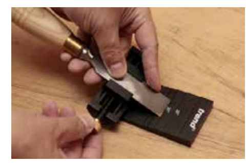
A You slide the blade through until it rests against the ridge of the required hone angle

The design also secures the blades by lifting them up against the top shoulders to ensure a parallel hone by means of sloping lower shoulders that automatically lift the blades