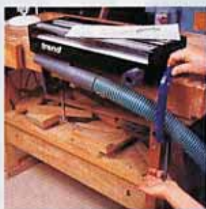
Above: Clamping down the baseboard Right: Fitting the guides

The jig was supplied with an 11.1mm ( \frac{7}{16} in) template-following collar of the Trend mount variety, which didn't fit the Makita. The Trend Unibase is an optional extra to get you around this – a perforated shoe to fit Trend accessories on the base of most other routers, but it is a bit awkward. If I were using the DC400 much I would obtain the right collar to fit the router.