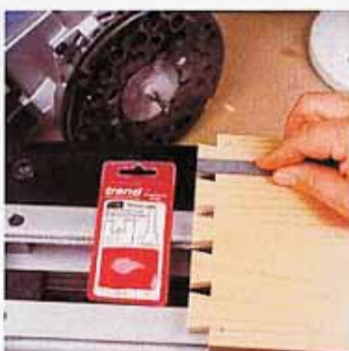
Above: Measure and record the successful lapped tail depth Top right: Through-tails are very tight Right: Cutting through-tails in knotty oak Below: A change of guide collar makes the tails fit

If you want the functionality and are prepared to pay for it, the DC400 multi-functional dovetail centre is a solid platform on which to build. ■