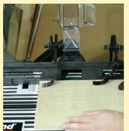
Table in action

8mm TC). At £39 and £49 respectively, their prices may cause a sharp intake of breath, but they really are a quality product. I used them to form a raised panel and moulded stile/rails in oak, and found them