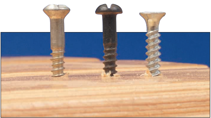
Head shapes — raised, round and countersunk