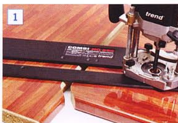
1 The jig lying on a test joint with a 1/2in router, 30mm guidebush and long, 1/2in-diameter cutter

As with most Trend equipment it comes with a good user manual. The simplicity of the jig makes setting up and using easier than with more complicated versions. I found it the easiest I have used and will be including it in an in-depth look at kitchen worktop mitring in a forthcoming issue.