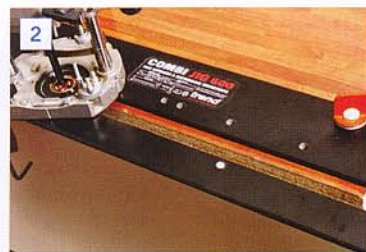
2 A completed female cut. The end location bush and clamp to position the jig for the cut are clearly visible