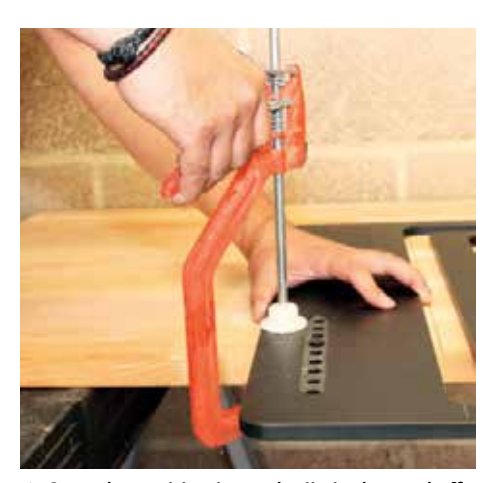
▲ Once the position is set the jig is clamped off securely