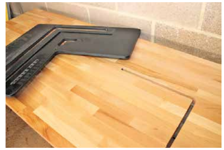
▲ The worktop is then flipped over and the marks transferred