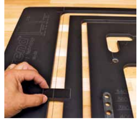
▲ The jig comes with a datum gauge block to correctly set it up to the layout lines