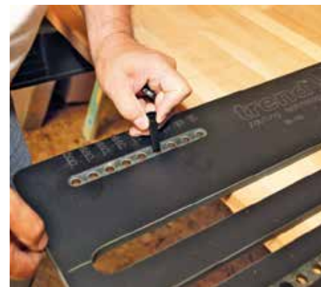
▲ Specific backsets can be set using the supplied pins

You need to rout the corners first and then join them, using the jig, to rout the straight runs. Again, datum scribes are used so that the jig aligns correctly if you opt for this particular radius setting.