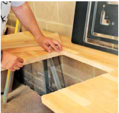
▲ The result is a crisp clean finish

You should also be aware that the waste is