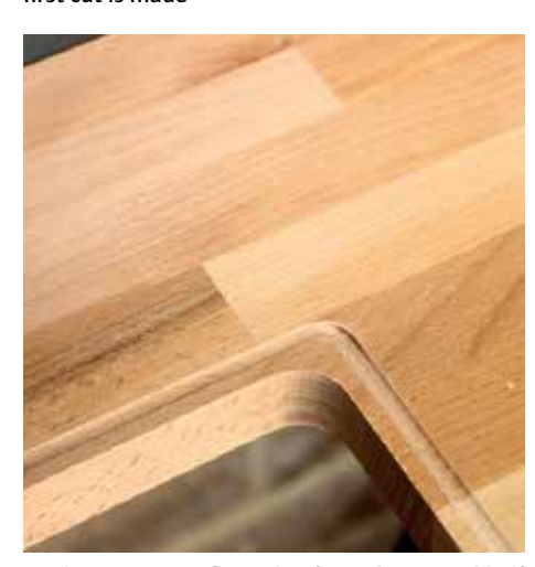
▲ The jig is again flipped to form the second half to leave a neat finish

doesn't let water run beyond the front edge and down the unit. Again, this is a two-part operation, cutting from the left and then flipping the jig to cut the right-hand side.