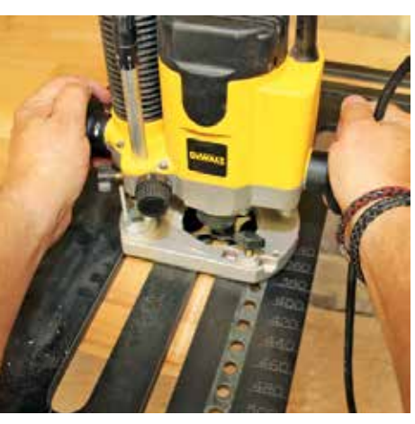
▲ With the jig set and clamped for the drip, the first cut is made

You should set the cut back in from the edge of the worktop by around 5mm so that it