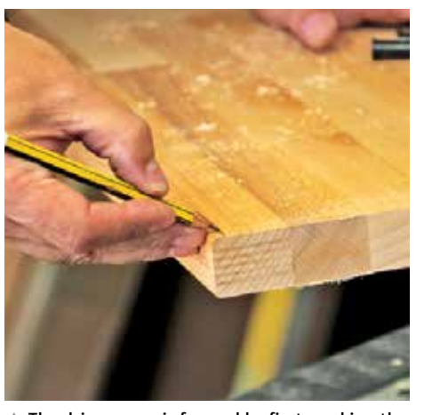
▲ The drip groove is formed by first marking the backset start and finish point for the cut

Had I thought about it, common sense would have told me that you should support the waste piece. Ah, but hindsight is a wonderful thing!