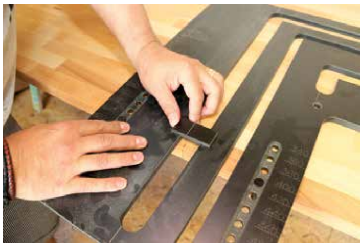
▲ The jig setup is then repeated...