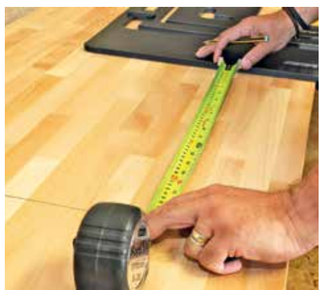
After establishing the aperture the top is marked up to the exact size