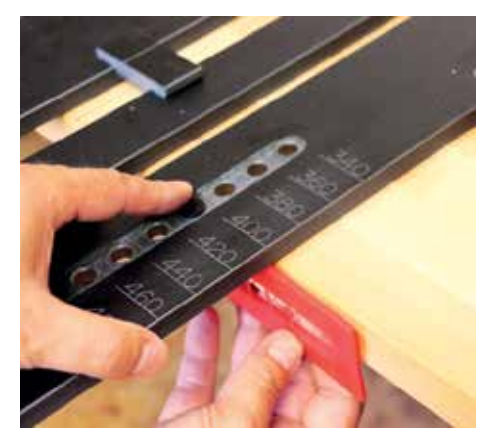
You can easily shim the jig to alter the backset if needed

a 25mm corner radius but if you want a tighter radius there's a small corner aperture within the jig that takes it down to 7mm.