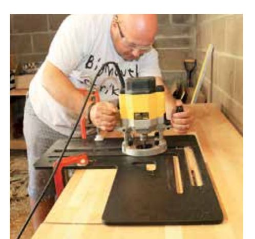
▲ ...to make the second half of the process