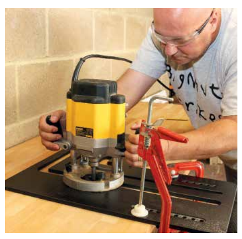
▲ The cut is made in two halves, working from the left inwards to avoid breakout