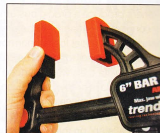
The clamp pads fit securely but are easily removed