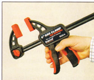
One-handed operation is a definite plus point