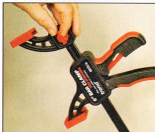
One head is repositioned for use as a spreader