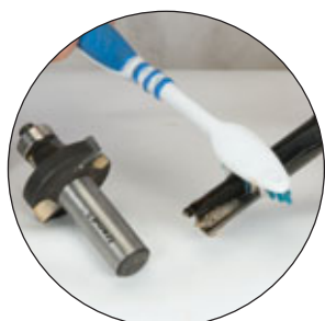
Cleans router cutters.