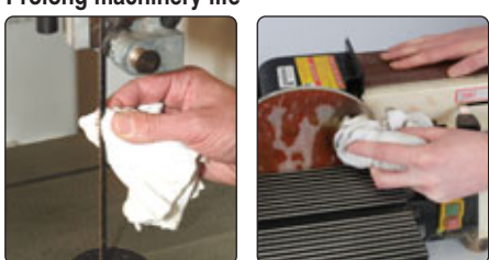
Sawing Machines, Bandsaws, Sanding Belts and Machine Beds So versatile - cleaner also acts as a rust inhibitor, prevents corrosion and reduces down-time.