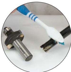
Cleans router cutters.