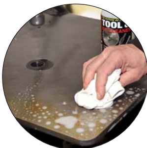
Removes resin and grime from machine bed surfaces.