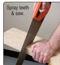
Spray teeth & saw.