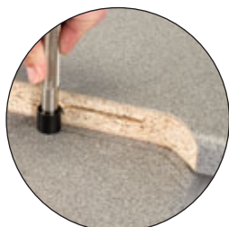
Worktop scribing facility.