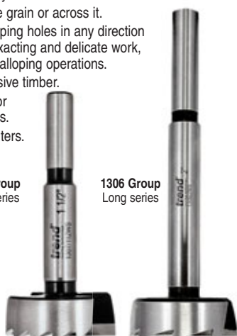
1306 Group Long series