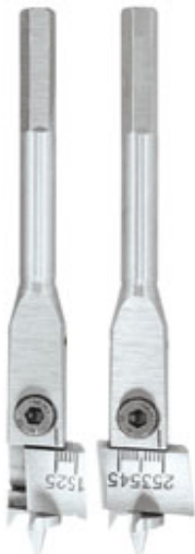
Blade B fitted